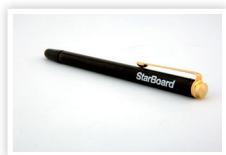
Stylus pen (included)